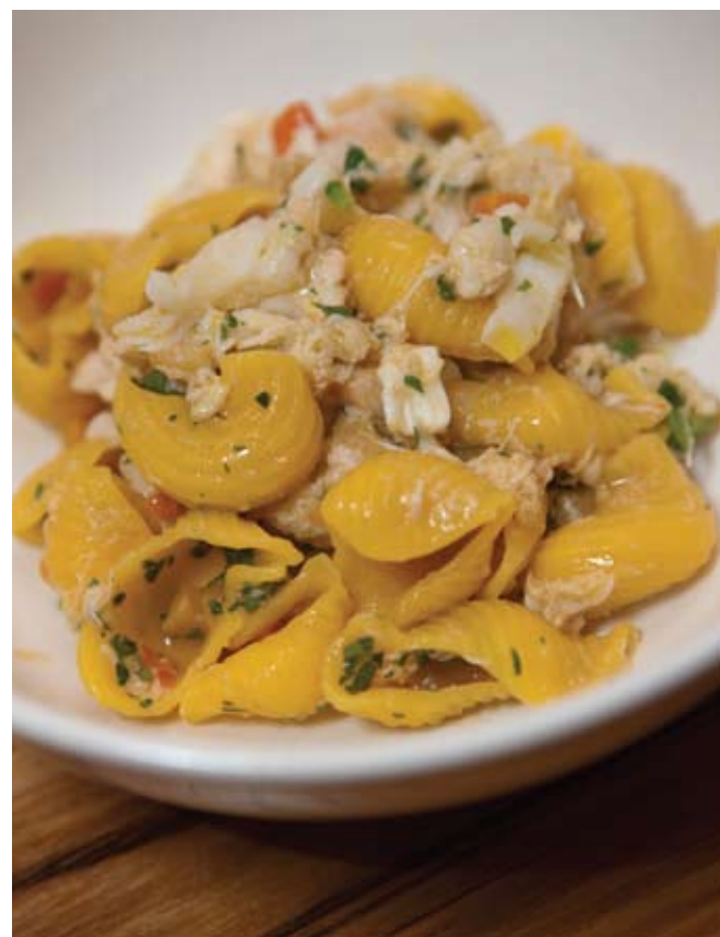
Prato's Widow Maker pizza (above left) is topped with salumi and sausage plus kale, egg and romesco sauce. The saffron conchiglie (above right) is a new dish on the menu featuring spicy Florida lobster and peekytoe crab.

So what should you order? You must start with the Campagna salad, in which rosemary-garlic-Parmesan almonds and sizzling pancetta cubes are tossed with greens in an ideally balanced balsamic dressing. Split it, though, because you'll also want to have the meatballs, possibly the most flavorful you'll ever try.