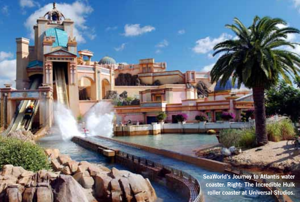
SeaWorld's Journey to Atlantis water coaster. Right: The Incredible Hulk roller coaster at Universal Studios.