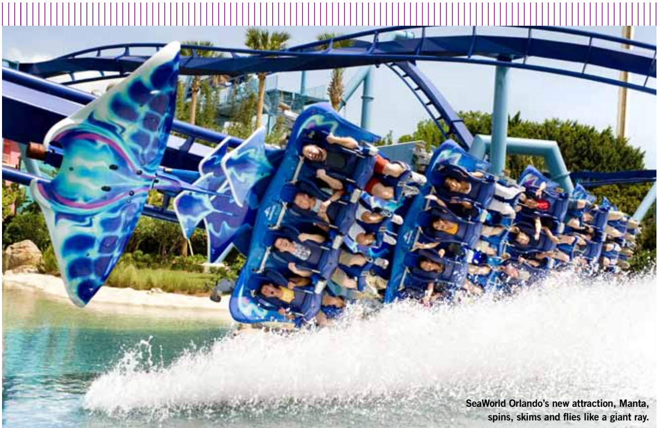
SeaWorld Orlando's new attraction, Manta, spins, skims and flies like a giant ray.