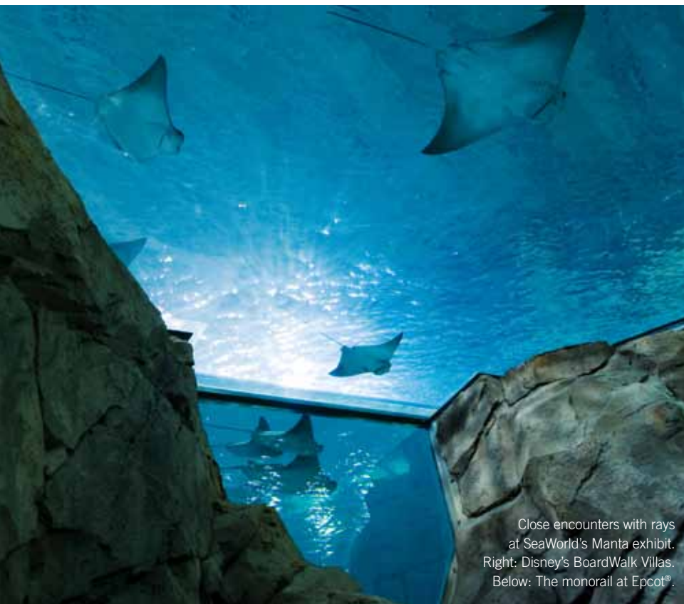
Close encounters with rays at SeaWorld's Manta exhibit. Right: Disney's BoardWalk Villas. Below: The monorail at Epcot®.