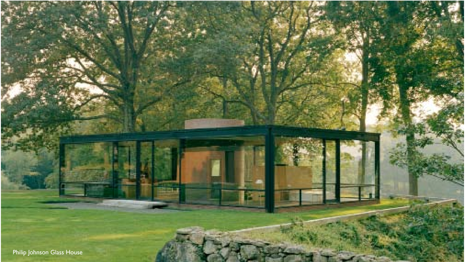
Philip Johnson Glass House

Venture to Connecticut's Gold Coast and immerse yourself in the best of the best – from yachts to couture dresses and world-class art.